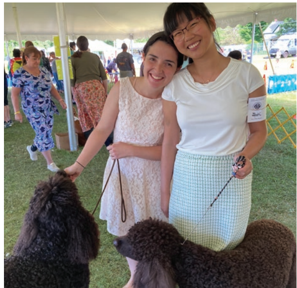
Good Friends at the Show