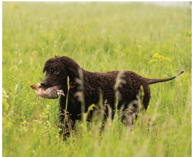
Finn on Land, June 2, 2024