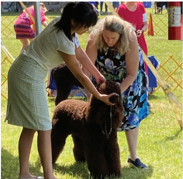
Going Over Jack