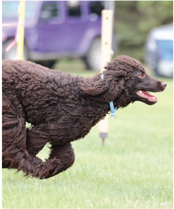
"Sway" Finnibone's On Your Knees Boys DJA HDNA DS DN in the CKC Sprinters Competition