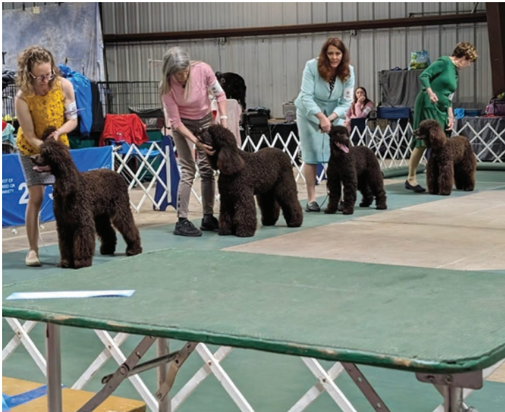
National Photo, June 21, 2024