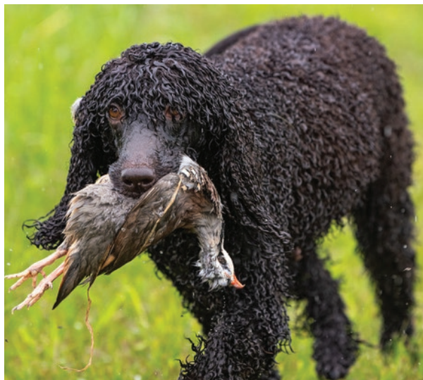
Harris on Land, June 1, 2024