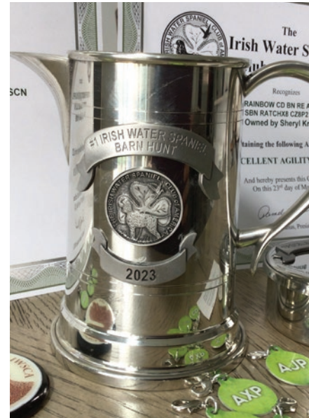
2023 Barn Hunt Trophy, June 21, 2024