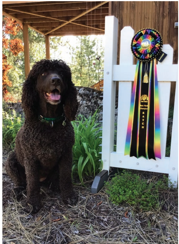
Raine with Rosettes, June 21, 2024