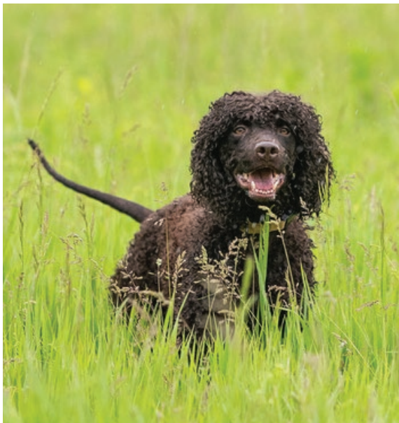
Lilly on Land, June 1, 2024