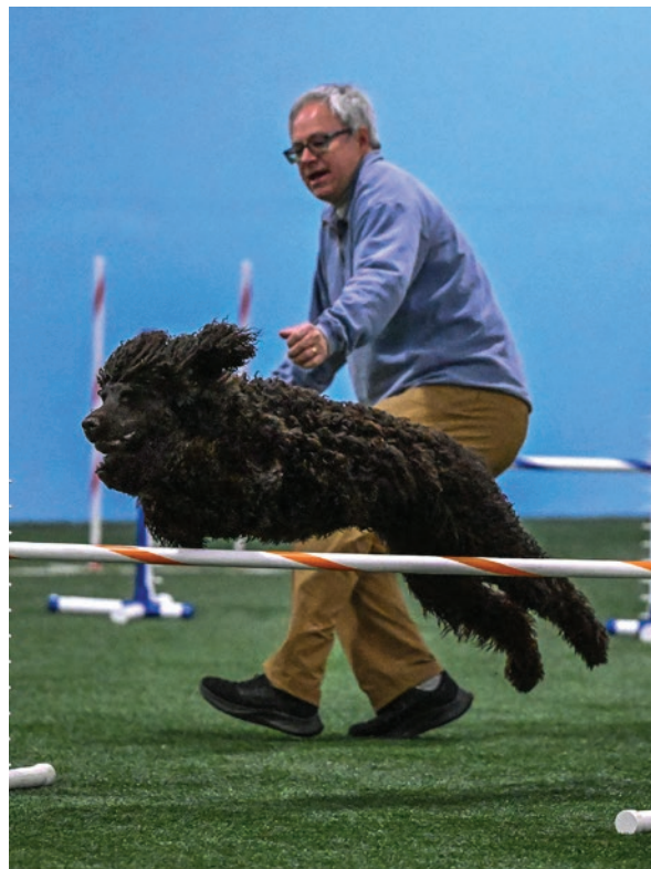
Arrow in Action