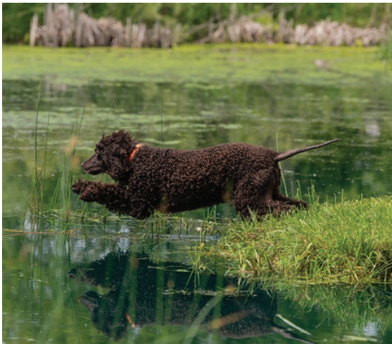
Finn Springs into the Water, June 2, 2024