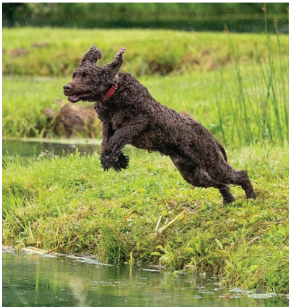
Doogan Jumps into the Water, June 1, 2024