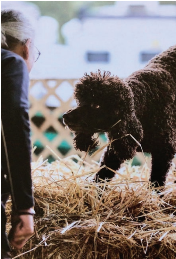
Raine is Ready! June 21, 2024