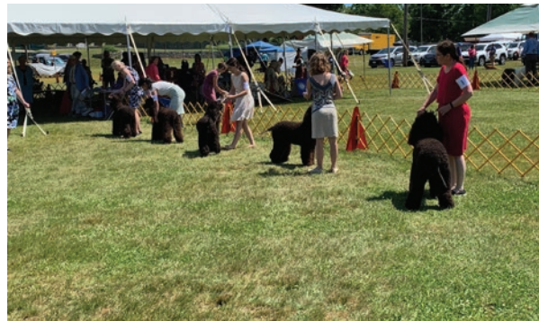
Best of Breed Line Up June 16, 2024