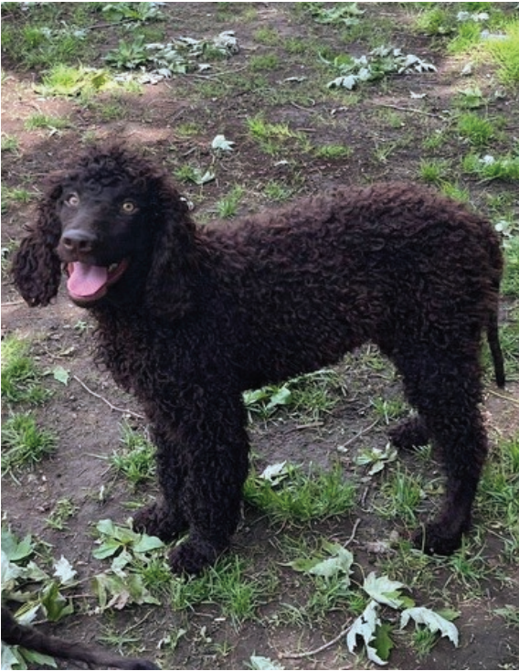
Wayne Dickson's Available Sweet Boy