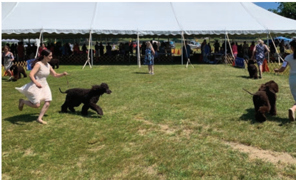
Best of Breed Go-Around June 16, 2024